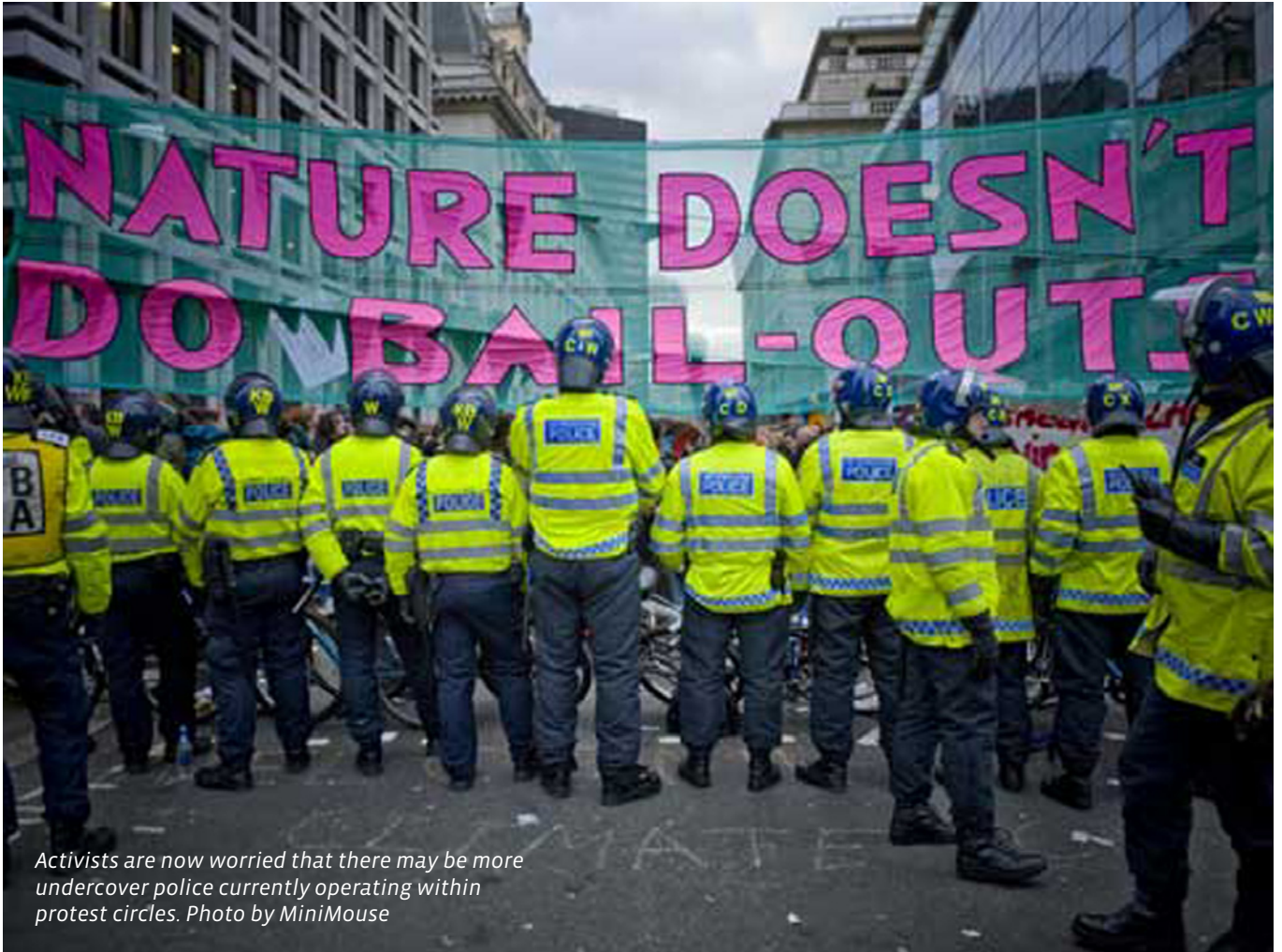
Activists are now worried that there may be more undercover police currently operating within protest circles.

about key activists in order to cause dissent within and between groups. These are all tried and tested methods, and in the words of Officer A, who admitted his role as a “hairy” for the Special Demonstration Squad in the Observer last year: “Once the SDS get into an organisation, it is effectively finished.”