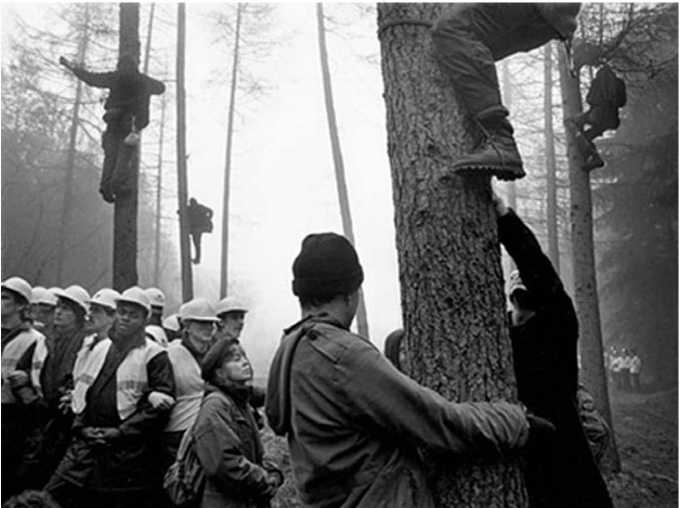
Between 1992 and 1997 opposition to the government's road building scheme led to massive protests, such as here at the site of the Newbury Bypass.

Opponents say the controversial bypass will damage ancient woodlands, disturb wetland birds and impact on protected areas - and it's just one of 22 similar schemes currently awaiting approval. Jan Goodey investigates