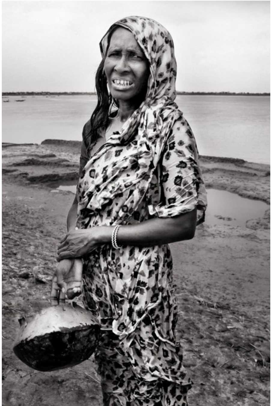
Bangladesh's coastal communities have suffered as a result of climate related natural disasters.