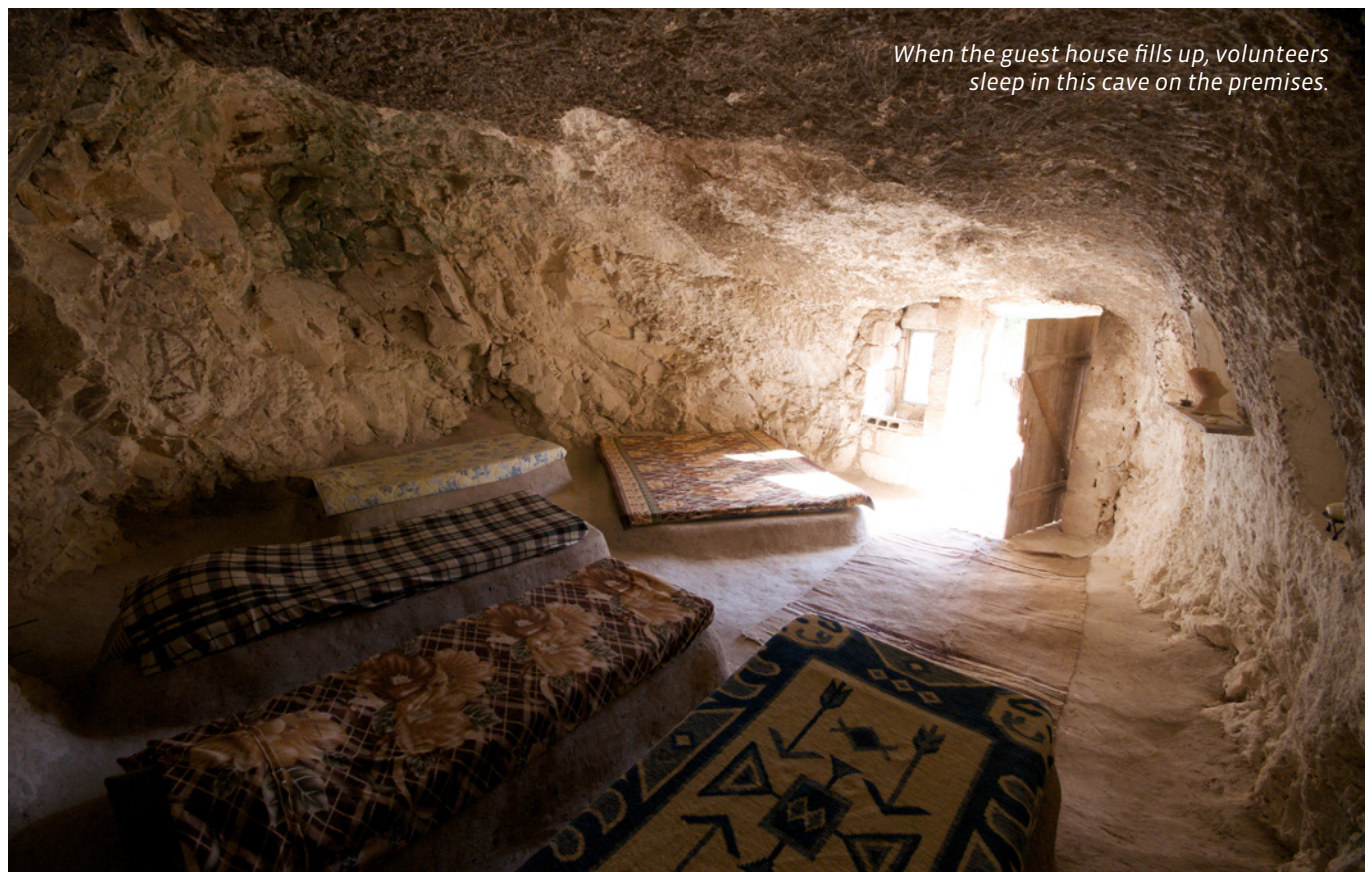
When the guest house fills up, volunteers sleep in this cave on the premises.

Opposite the West Bank's only tree nursery, which was struggling somewhat with the prolonged drought and heat, there is a cave that's been converted into a hostel room for volunteers and visitors when guest numbers are high. Each bed foundation is constructed out of tyres and rubbish, around which a combination of straw, mud and manure has been added to provide a solid base, with a mattress thrown on top. They don't throw away any waste but try to recycle everything,