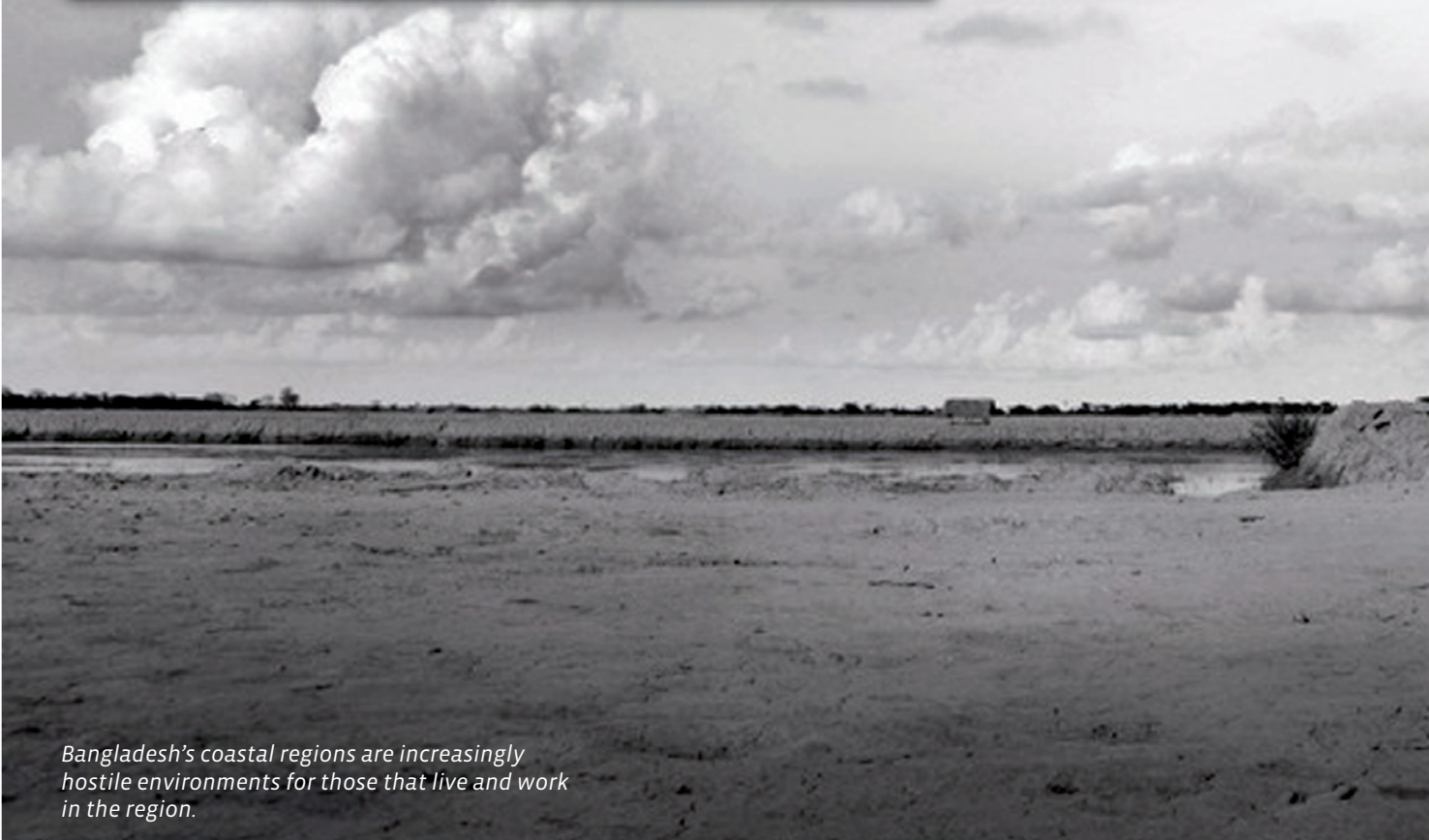
Bangladesh's coastal regions are increasingly hostile environments for those that live and work in the region.