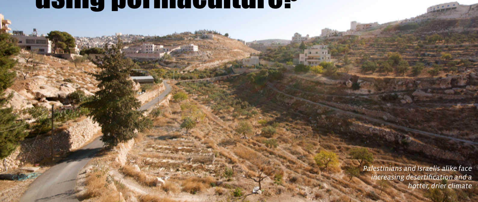
Palestinians and Israelis alike face increasing desertification and a hotter, drier climate

An unreported war over natural resources in Israel and the occupied Palestinian territories has led students from Bangor University to set up a radical eco-movement, Bustan al Qaraaqa, to tackle the issue.