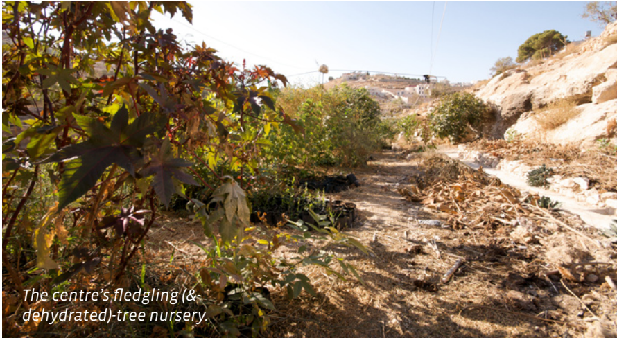
The centre's fledgling (& dehydrated)-tree nursery.

trying to modernise, aspirations to Western affluence or culture or elements of it. People have got into their heads that [piped] water is the only decent quality water.'