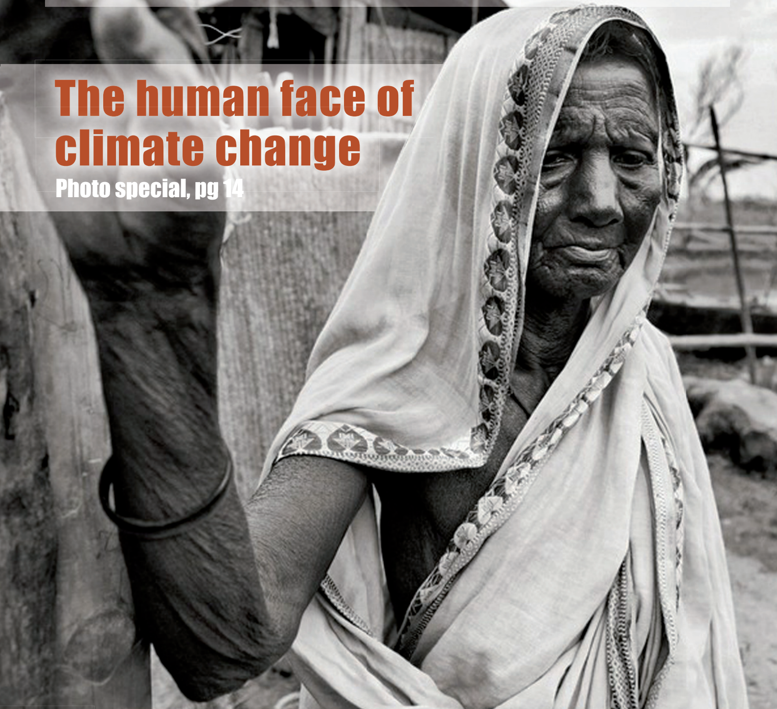
Photo special, pg 14