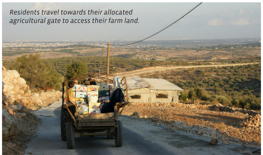
Residents travel towards their allocated agricultural gate to access their farm land.

'Of course there are plenty of examples of permaculture being practised by Palestinians, as they've traditionally done, especially in refugee camps, where there are acute water shortages. It hasn't been lost, it's still there, and it's been a necessity for generations. But I think there's an element of... sometimes I call it "obsession with shiny things",' she says. 'It's