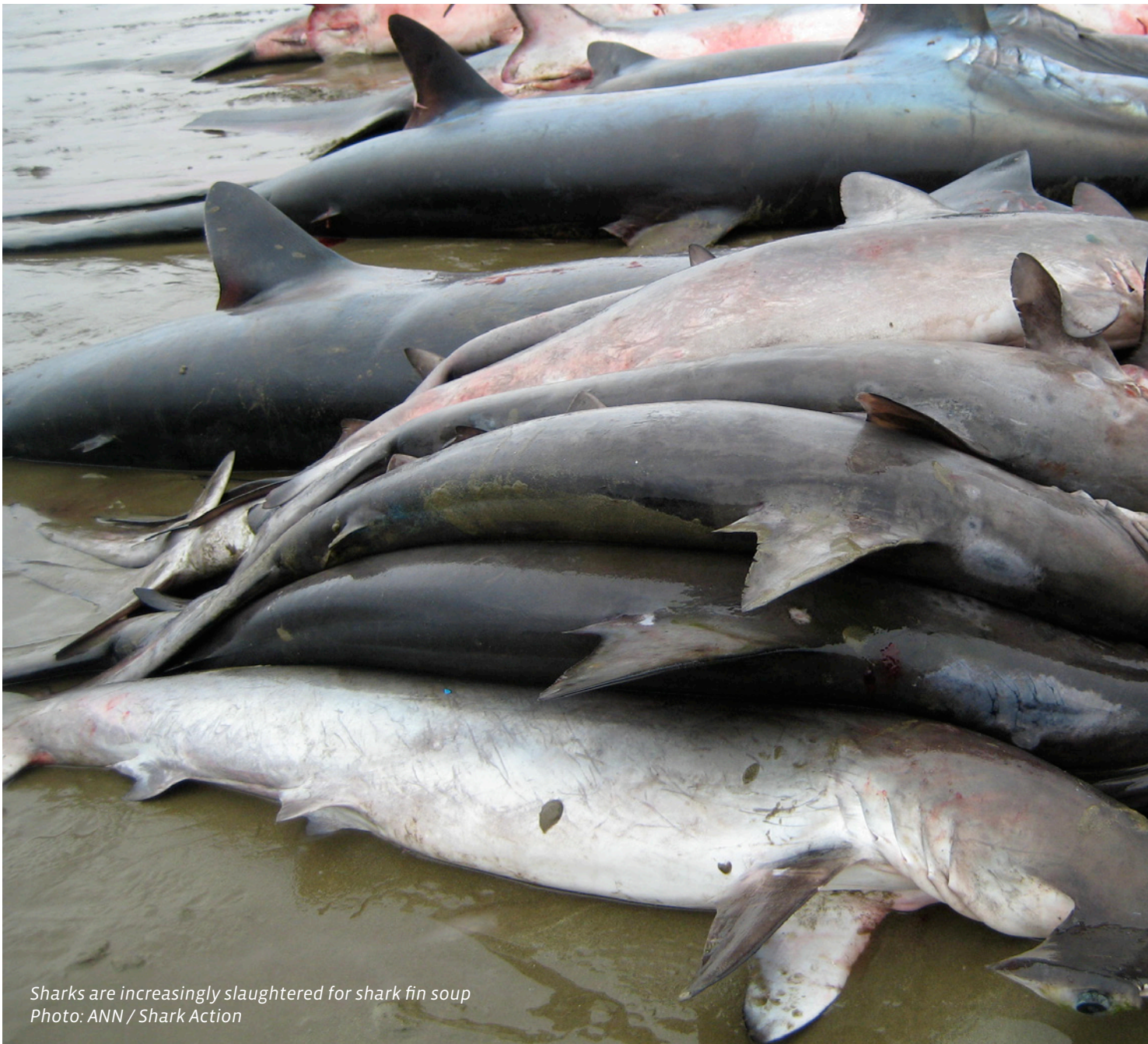
Sharks are increasingly slaughtered for shark fin soup