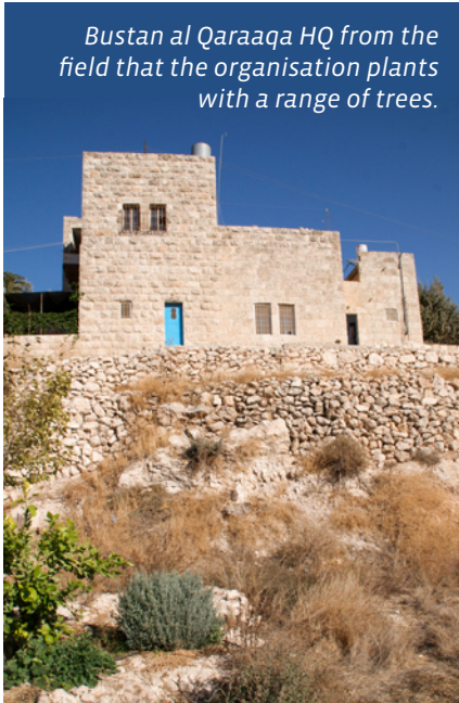
Bustan al Qaraaqa HQ from the field that the organisation plants with a range of trees.

and there are hidden stacks of rubbish stored for future use. It's hippy living and everyone, including three volunteers from Australia and the US, seemed dedicated yet relaxed.