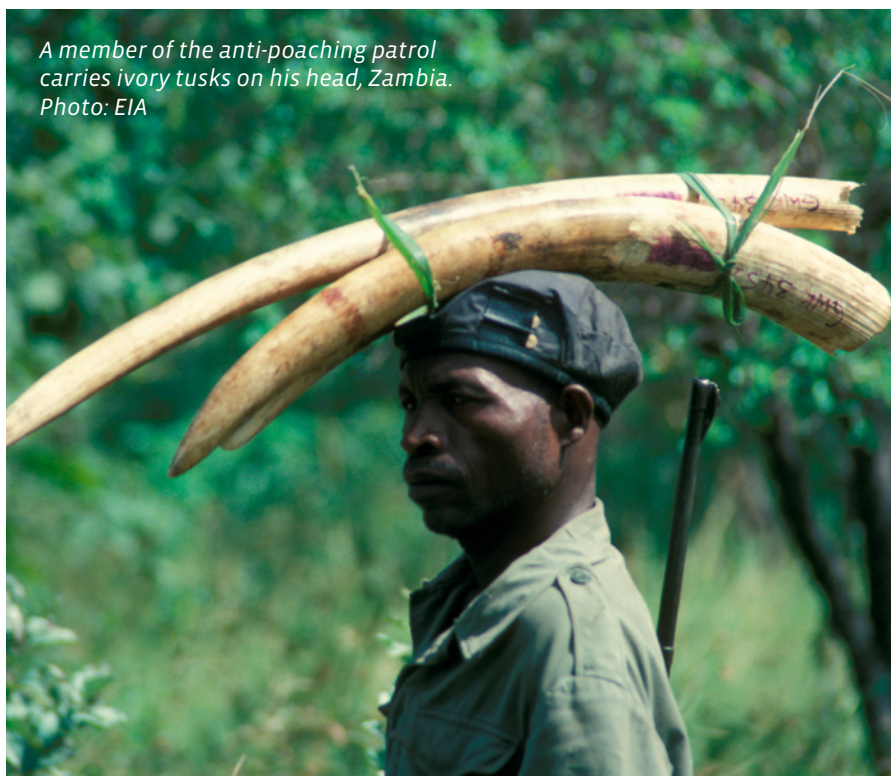
A member of the anti-poaching patrol carries ivory tusks on his head, Zambia.

'We don't understand how they arrive at their decisions when we have evidence to illustrate that