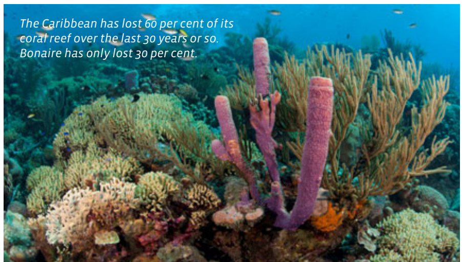
The Caribbean has lost 60 per cent of its coral reef over the last 30 years or so. Bonaire has only lost 30 per cent.

For the long term, Bruckner is optimistic. 'The historical record shows corals are pretty adaptable,' he says. 'If we can restrict fishing and pollution and create more marine reserves, I think we can save some of the Caribbean's coral reefs. But even if we don't, in places like the remote Pacific islands, I think the more vulnerable coral species will die off and be replaced by tougher ones. I just don't see them dying off completely.'