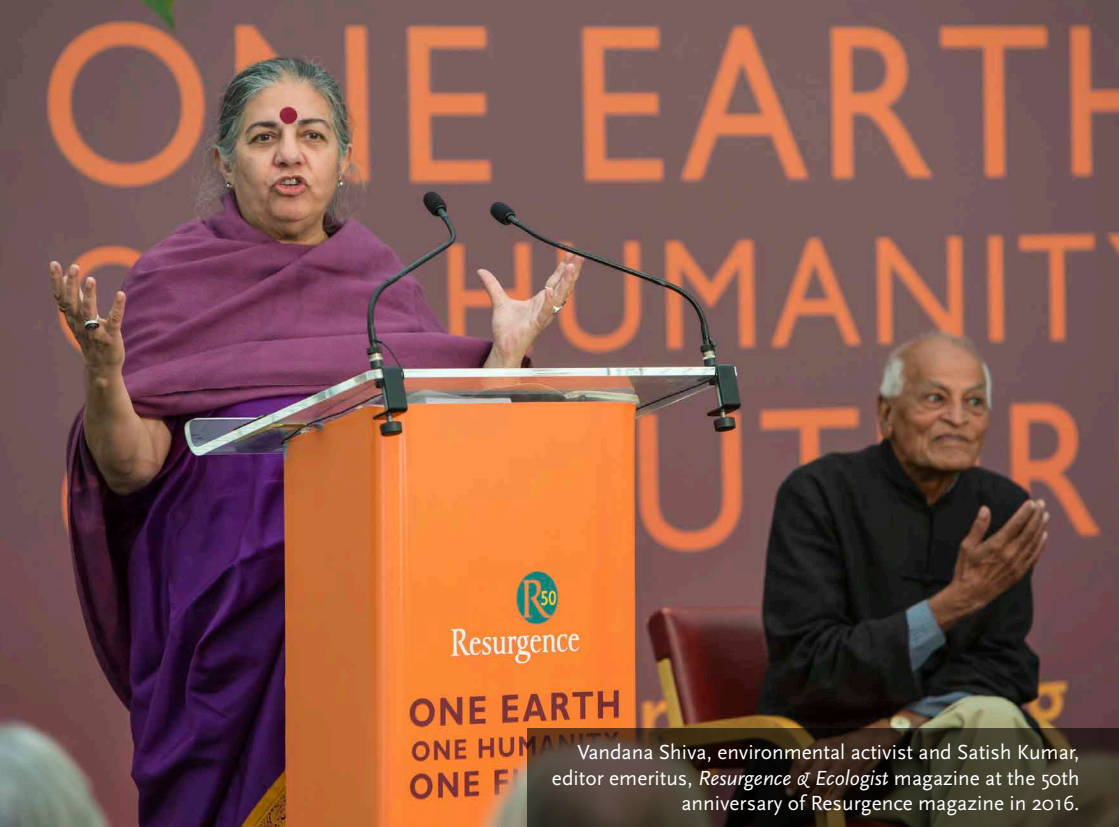
Vandana Shiva, environmental activist and Satish Kumar, editor emeritus, Resurgence & Ecologist magazine at the 50th anniversary of Resurgence magazine in 2016.